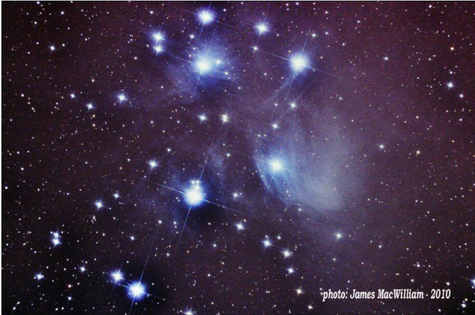
M45 – The Pleiades, also known as The Seven Sisters.

The Pleiades or Seven Sisters is the most famous star cluster in the sky. Subaru is the Japanese name for The Seven Sisters and Subaru Motors uses the star cluster as its emblem.