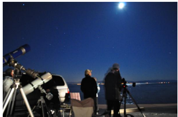
Members of The Sunshine Coast Astronomy Club stargaze at Davis Bay, May, 2010.

There are also online sky maps such as the ones at SkyAndTelescope.com - see the 'Observing' tab. There are also pages for Jupiter, its Moons, and Saturn.